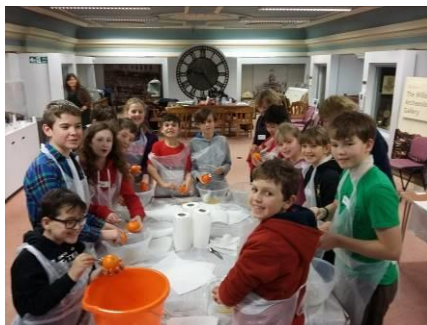
YAC Have Fun at the Willis