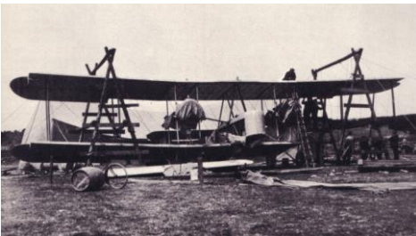
Vickers Vimy being assembled at St. John's, Newfoundland, 1919

USNC 4 was therefore the first aircraft to cross the Atlantic but having done so in stages did not qualify for the Daily Mail prize. These flights indicated that trans-Atlantic passenger carrying aircraft could become reality.