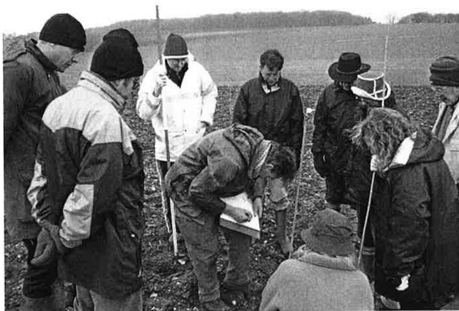
Learning about CBM (Ceramic Building Material)

This field walk was a learning experience for all involved; some of us learnt how to organise a field walk more efficiently; we learnt some valuable lessons in setting up right angles and keeping lines straight and we all learnt what to look out for. By the third Saturday we had quite a slick operation and most of the regulars could get going straight away.