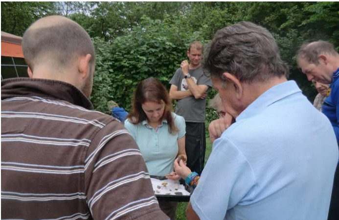
Great Concentration During Dig Basing! 2017 (see pages 5 & 11)